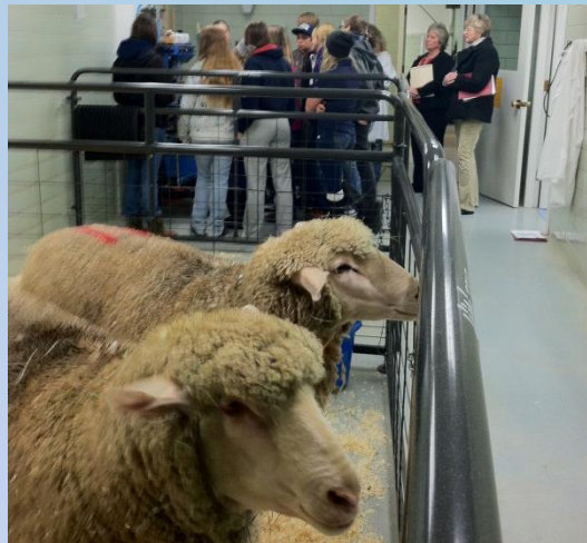
UM CHPBS, Dec., 2013 (2), 120 Big Sky freshmen