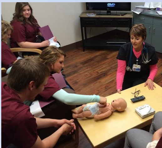
Providence St. Joe, May, 2014 28 Polson & St. Ignatius juniors & seniors