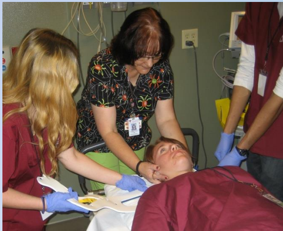
St. Luke Hospital, Oct., 2013, 41 Charlo & Ronan sophomores