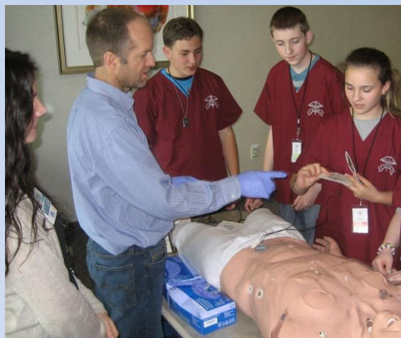
Kalispell Regional Healthcare, Apr, 2014, 86 from Eureka & Thompson Falls 8 th graders