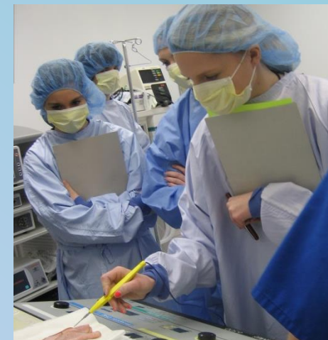
Mineral Community Hospital, Feb, 2014, (2) 44 Superior, Alberton & Regis sophomores